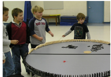
Dominoes in motion at Our Time.