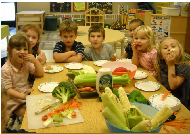
Woodside Pre-K Class gets ready to share in their harvest feast.