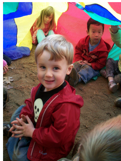
Pinkham Road Preschool Children

All friends, family community members welcome!